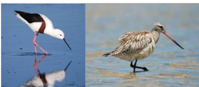
Left: Banded Stilt, Wilson Inlet. Right: Bar-tailed Godwit, Wilson Inlet.

Where: Centre for Sustainable Living, 972 South Coast Hwy, Denmark