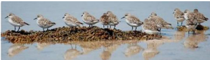
Above: Red-necked Stints at Rushy Point, Albany.

A regional community volunteer based shorebird survey of key coastal sites from Walpole to Bremer Bay in the South Coast Region (and including the Esperance coastline) in early February 2012. This will be followed by data analysis and report in conjunction with local groups.