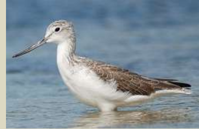
Common Greenshank