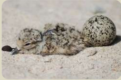
Hooded Plover nest